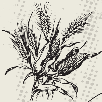
95% Rye 5% malted Barley