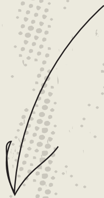
Distinctly Rich & Complex Character