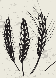
Local New York Grains