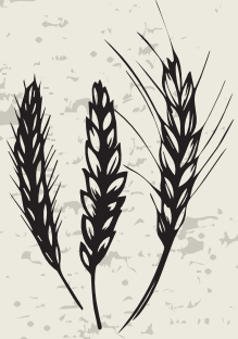
Local New York Grains