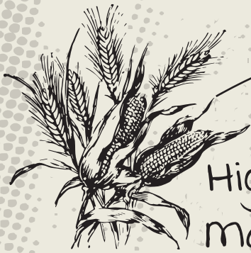
High Rye mash Bill